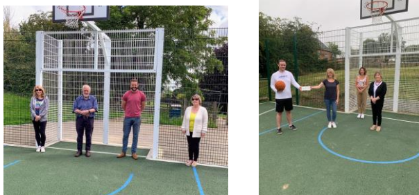
Opening of MUGA and handing over of s106 funding

On behalf of Kibworth Joint Recreation Committee (as it was then) I helped the clerk apply for planning permission in 2019/20 for a Multi Use Games Area (MUGA) for the old skatepark site on Warwick Park. A successful section 106 application for funding meant the new facility was installed in the Spring 2020. A location for a new skate park is still being considered.