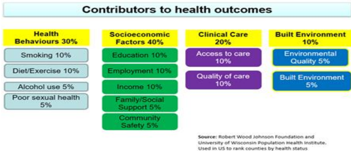
Figure 5 Contributors to health outcomes

of the causes', which will transform the population's health and help break cycles of intergenerational inequality. Key priorities to drive this change are detailed below.