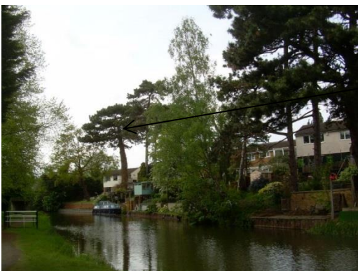
Corsican pine T1 showing line of protected Corsican pine trees