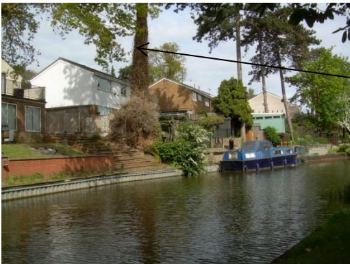
Corsican pine T1 showing line of protected Corsican pine trees