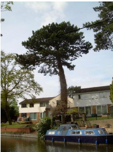
Corsican pine T1