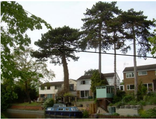
Corsican pine T1